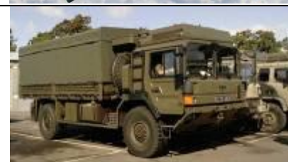
MAN Support Vehicle

HADR Capabilities LYME carries an enhanced Humanitarian Aid and Disaster Relief (HADR) Troop consisting of 30 personnel. This includes specialist drivers, artisan tradesmen (2 Carpenters, an Electrician, a Plumber and a Mechanical Fitter), Communications specialists, Plant and Vehicle mechanics and specialist boat operators. Vehicles carried include 4 Landrovers with trailers (including Fit for Radio, Field Repair and Battlefield Ambulance variants), 2 Pinzgauer, 4 MAN 6-tonne support vehicles and 1 JCB Light-wheeled Tractor.