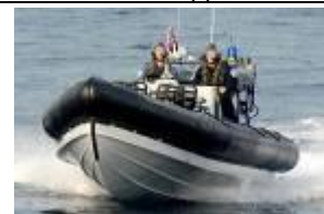
2 PAC 24 Boats

Ship's Capabilities RFA LYME BAY is an amphibious landing support ship, designed to deploy troops of Royal Marines onto the beaches of an enemy shore. Her primary role means that she is also ideally suited to delivering humanitarian assistance. Her shallow draft allows her further inshore than other ships of her size; and once in position, she can deploy her flotilla of small craft from the floating dock within. Her large flight deck allows continuous day and night helicopter operations, and her hold can contain the troops, stores, vehicles and medical equipment to sustain and rebuild a stricken community.