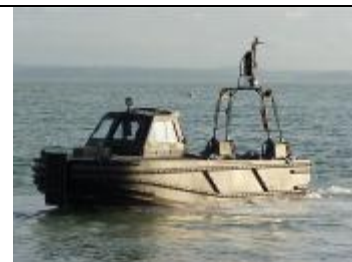
1 Combat Support Boat